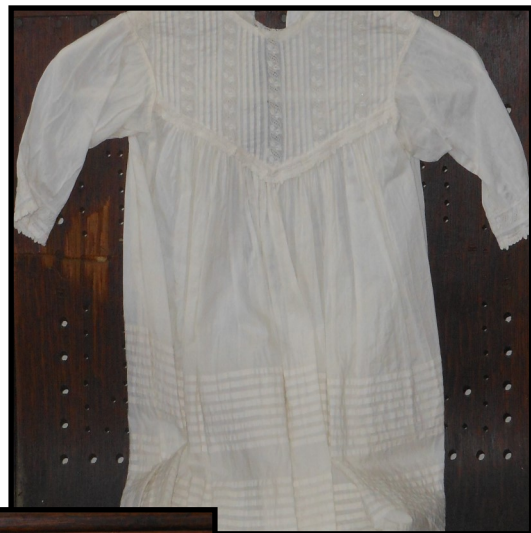
Infant's cotton dress with pintuck bodice