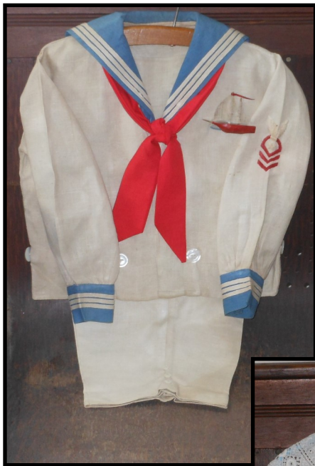
Child's linen sailor suit