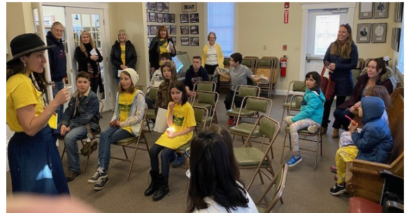
Waiting to Begin!

All participants started with a "passport" with questions relating to the various displays. The "hunters" had to find the correct display and then find the correct answers. Board members and other volunteers were stationed around the museum to answer questions and to verify the answers. Once the passport was completed, it was stamped with the Historical Society's logo.