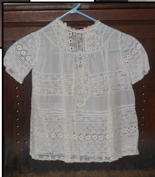
Infant's lace dress