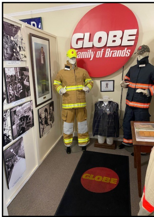
Globe Manufacturing Display

Please support your historical society and purchase a calendar!