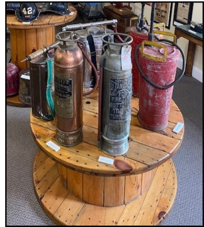
Vintage Fire Extinguishers