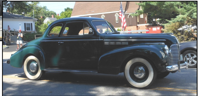
"Alice" 1940 Buick Coupe Special, driven by Luke Koladish