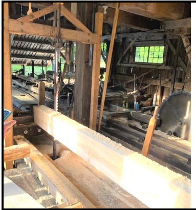
Up-and-Down Saw Mill

Thank you for taking the time out of your busy schedules to join us!