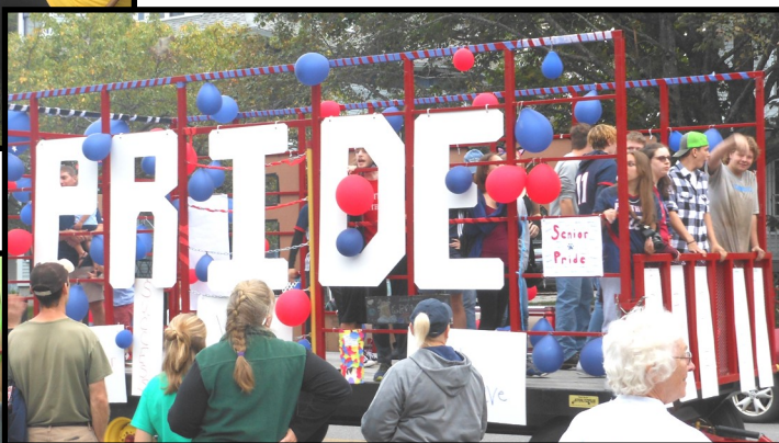
Parade Float Senior Class