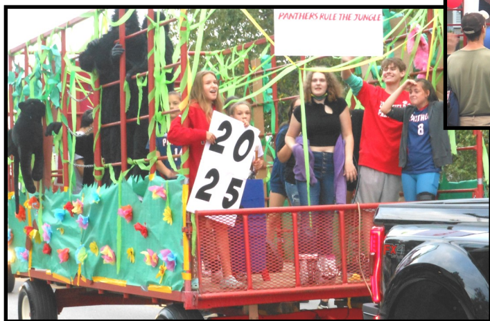
Parade Float Class of 2025