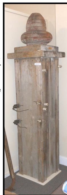
Wooden Column from the Pittsfield Fairgrounds

Annual Meeting—January 11, 2022 6:00 p.m. 4 Oak Street, Pittsfield