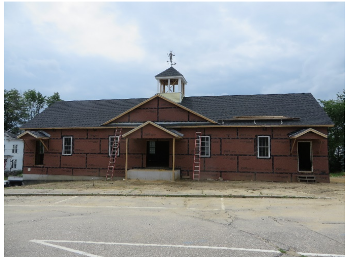
Cupola and Porch Roofs Installed, 7-12-2019