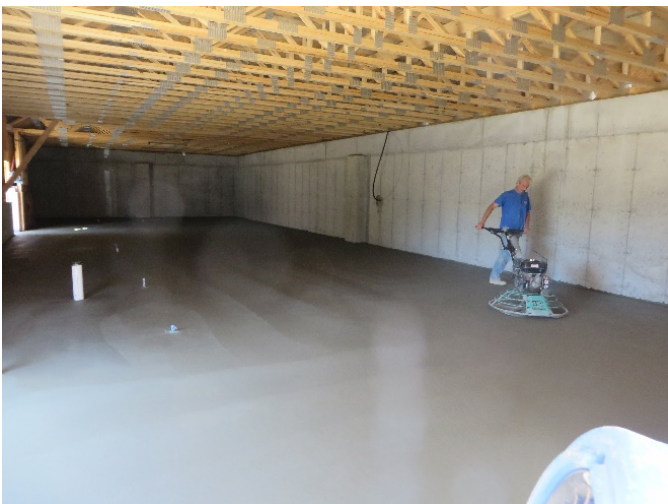
Finishing the Concrete on the First Floor, 8-26-2019