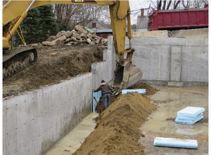
Insulating Interior of Foundation, 4-27-2019