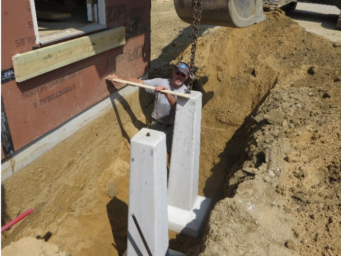
Installing the Porch Supports, 7-27-2019