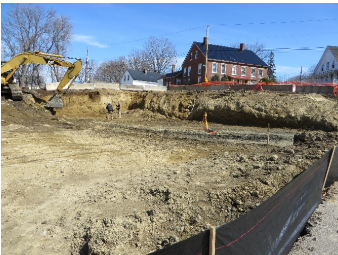
Foundation Dug, 4-2-2019