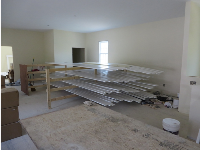
Trim Painted, 7-3-2020