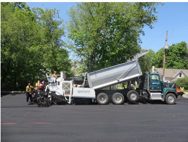
Parking Lot Being Paved, 5-26-2020