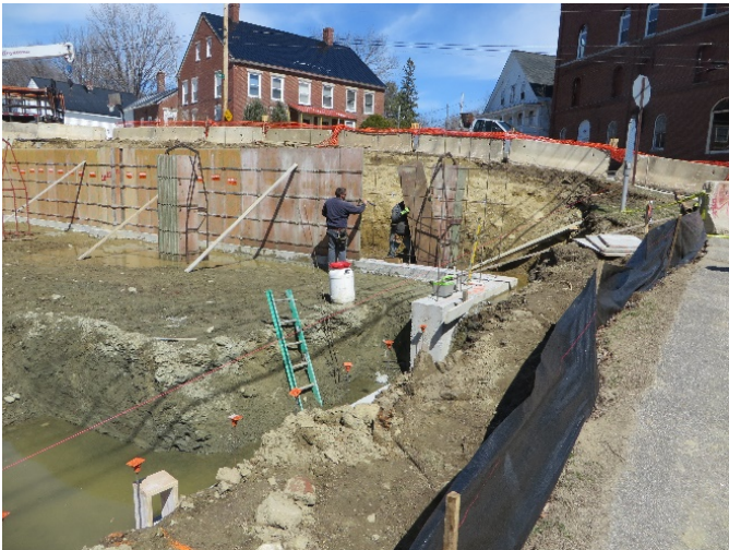
Installing the Forms for the Foundation, 4-11-2019