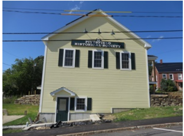
Main Street Side of Building #2, 8-8-2020