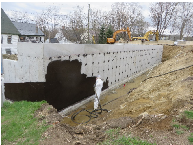
Coating Foundation, 4-24-2019