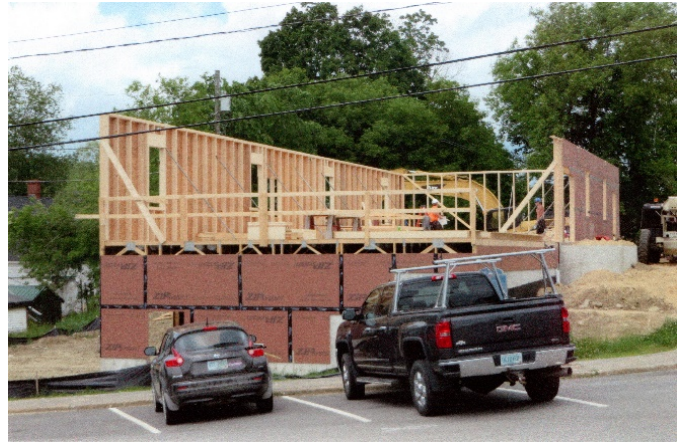
Framing Walls for Second Floor, 6-14-2019