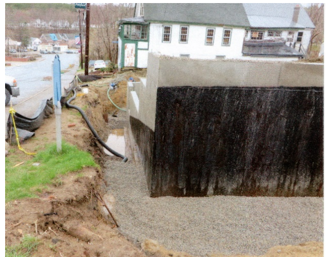
Stone Covering Perimeter Drain, 4-19-2019