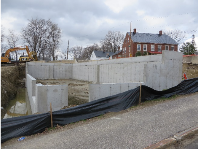
Foundation Walls Poured, 4-19-2019