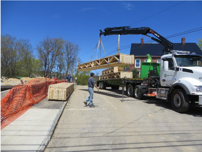
Unloading Floor Trusses, 5-8-2019