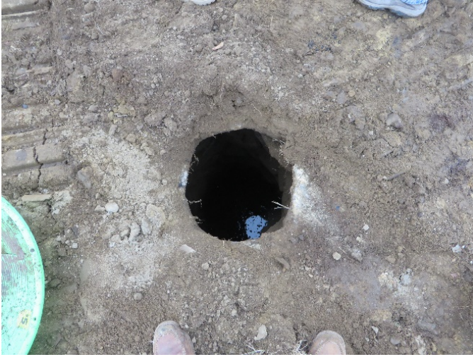
Discovering Old Well, 3-29-2019