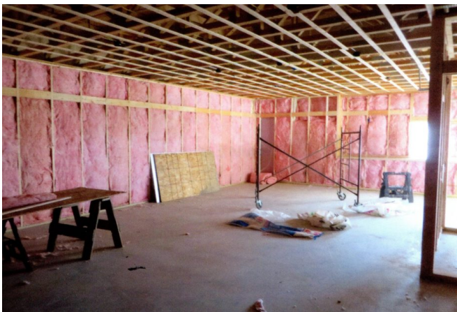
Insulating Nearly Completed on First Floor, 2-25-2020