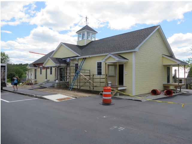
Building Being Sided, 5-30-2020