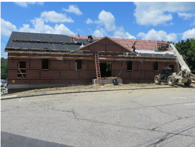
Shingling the Roof, 6-26-2019