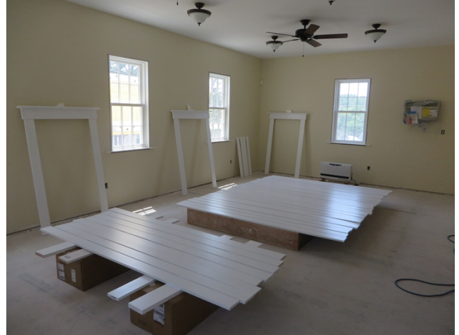
Door Trim painted, 7-3-2020