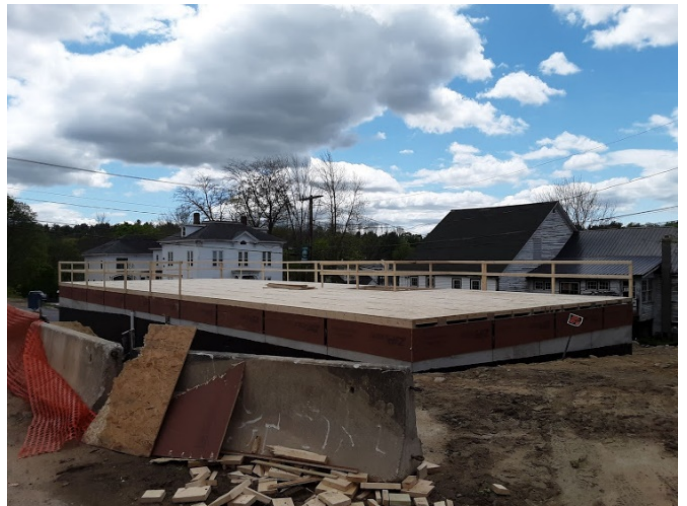
Decking for Second Floor in Place, 5-24-2019