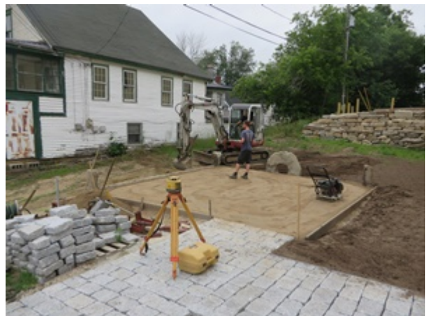
Installing Base for Brick Patio, 7-8-2020