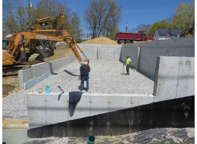
Placing Stone under First Floor, 5-9-2019