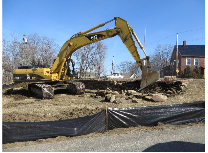
Digging the Foundation, 3-28-2019