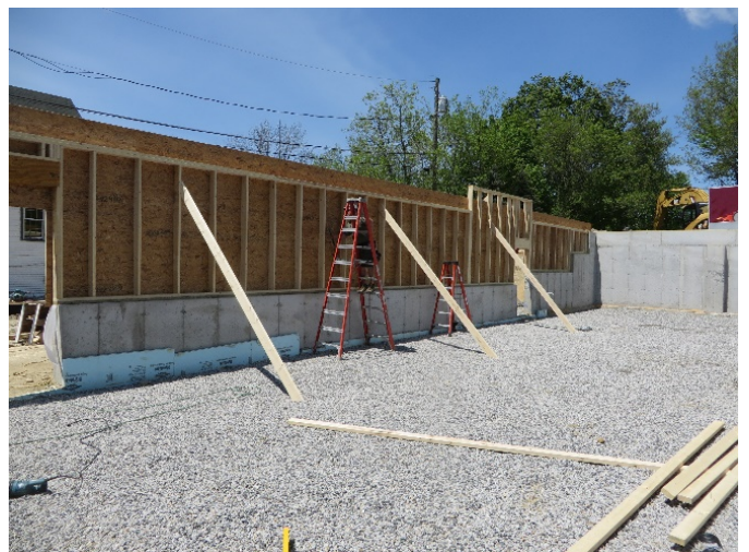
Framing the First Floor, 5-22-2019