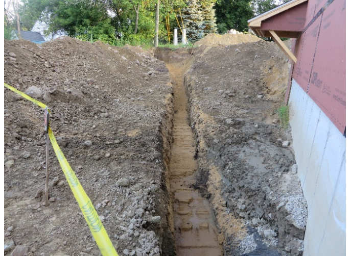
Electrical Entrance Trench, 7-27-2019