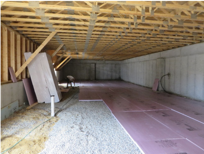
Installing the Floor Insulation, 7-12-2019