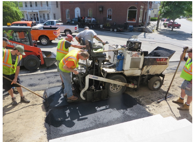
Walkway being paved, 5-26-2020