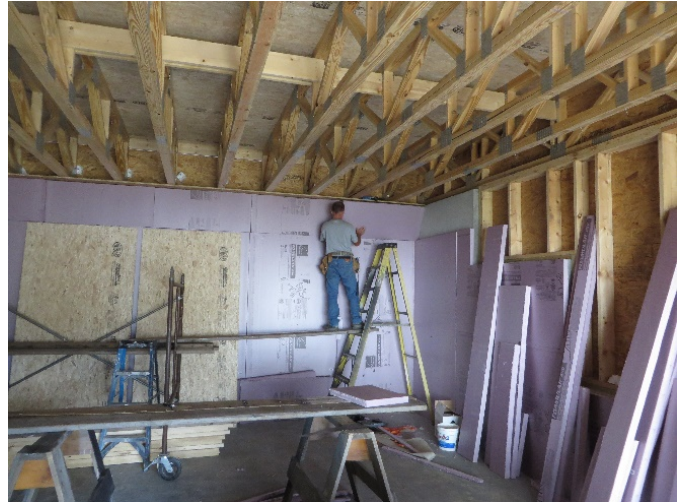
Installing Insulation on First Floor, 9-3-2019