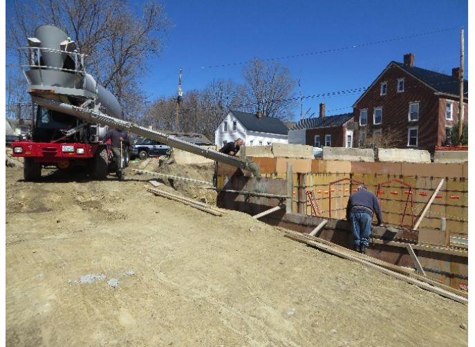
Pouring Foundation Walls, 4-17-2019