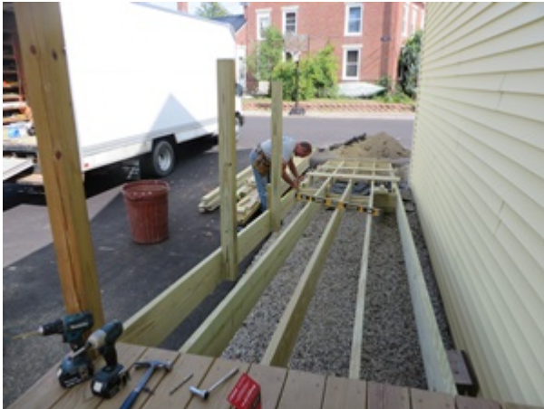
Ray Webber Building Handicap Ramp, 9-14-2020