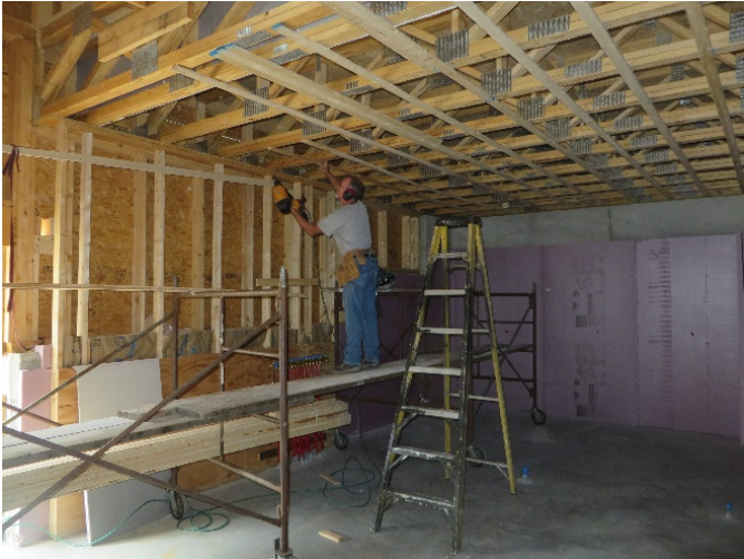
Strapping the First Floor Ceiling, 9-4-2019