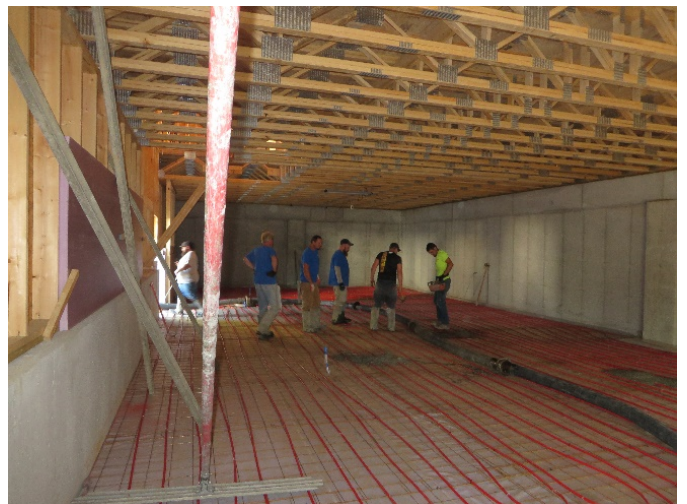
Installing the Radiant Heat Piping, 8-20-2019