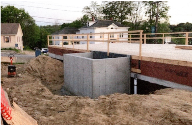
Porch Foundation, 6-8-2019