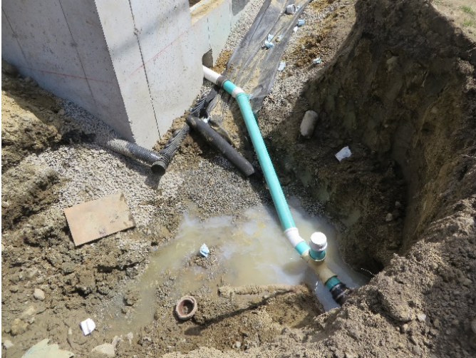
Installing Sewer Drain, 5-9-2019