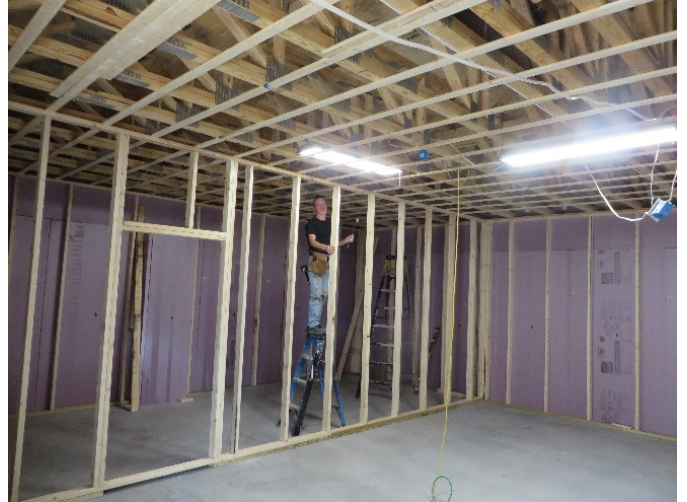
Framing the First Floor, 9-5-2019