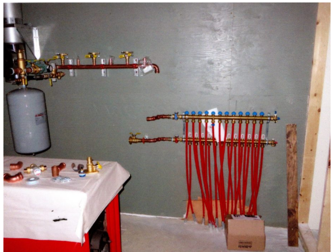
Heating Unit Being Installed, 10-30-2019