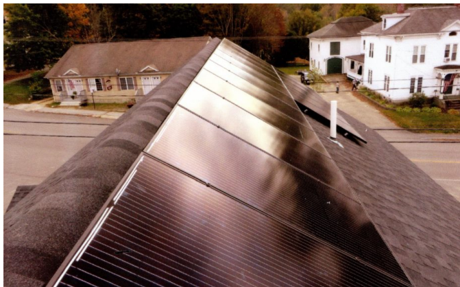
Solar Panels Installed, 9-25-2019