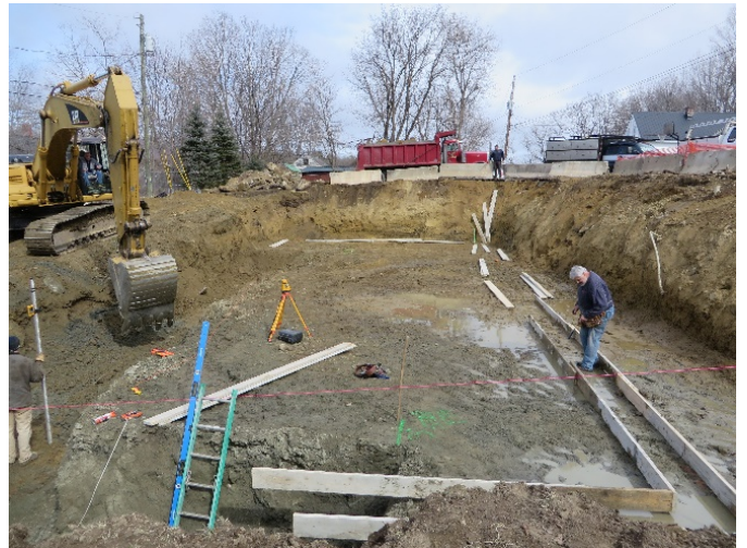
Forming the Footings for the Foundation, 4-3-2019