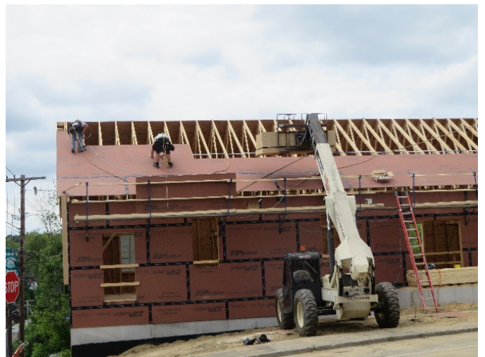
Installing the Roof, 6-19-2019