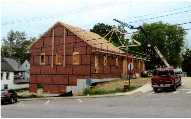
Installing the Roof Trusses, 6-19-2019