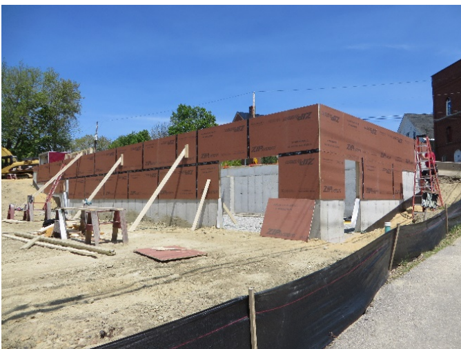
First Floor Framed, 5-22-2019