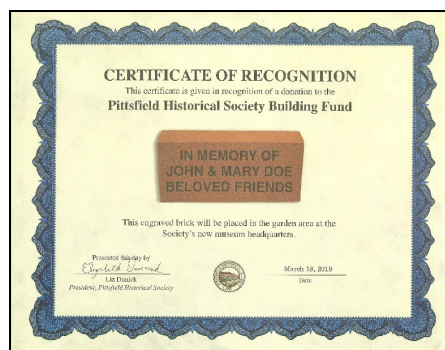
Certificate of Recognition for Purchasing a Brick