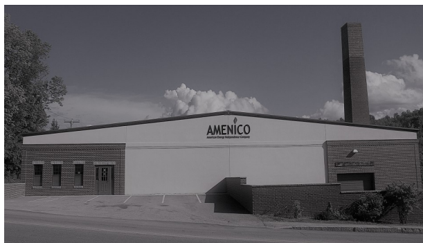
AMENICO Located on Main Street Pittsfield

If you would like to see the building plans or would like more detailed information, please stop by at the museum on a Tuesday morning between 9:00 a.m. and noon. If the flag is out, the doors are opened.